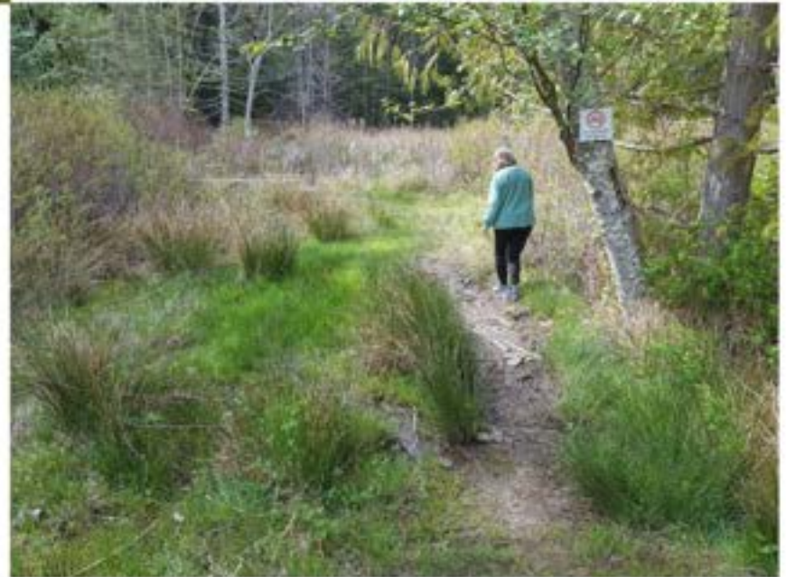
Photo: From the playground equipment to the creek requires raising above the water table.