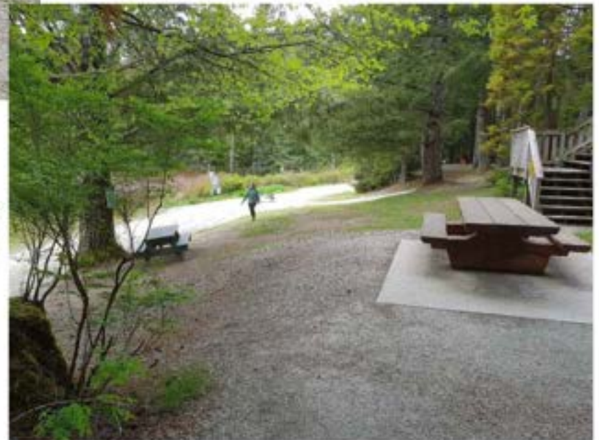
Photo: From the picnic table looking west, the accessible path requires reduced cross fall and surfacing with gravel down to the playground equipment.