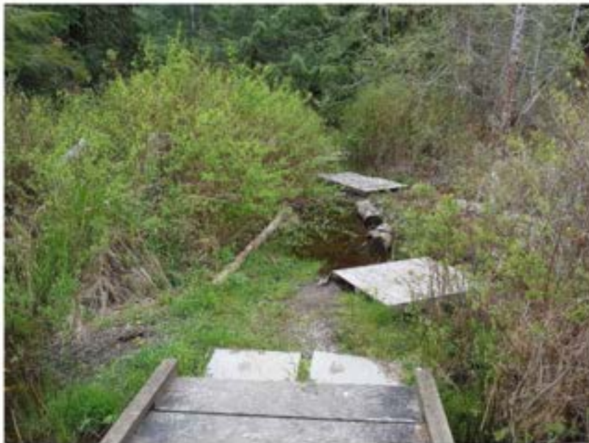
Photo: From the bridge across the creek there is approximately 30 meters of wet area that requires raising above the water table and surfacing with gravel.

Western painted turtle viewed from existing bridge.