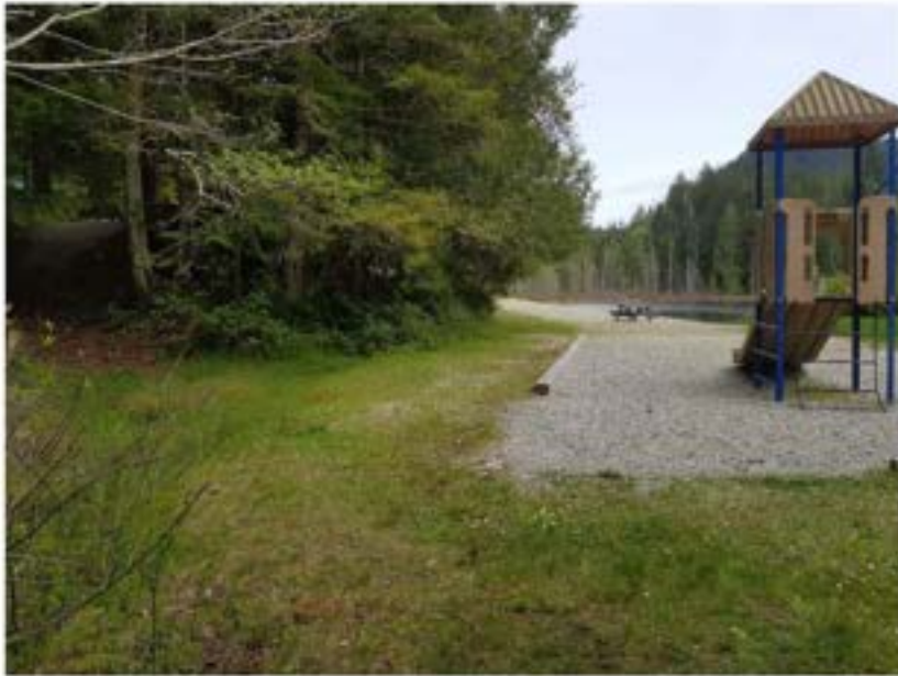
Photo: The accessible path will run on the left (north) of the playground equipment.