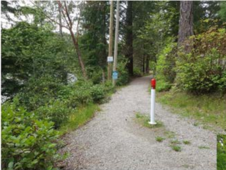
Photo: Looking west from the existing handicap parking the existing trail runs 70 meters to the picnic table.